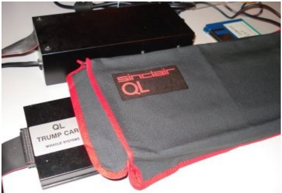
The QL Dust Covers